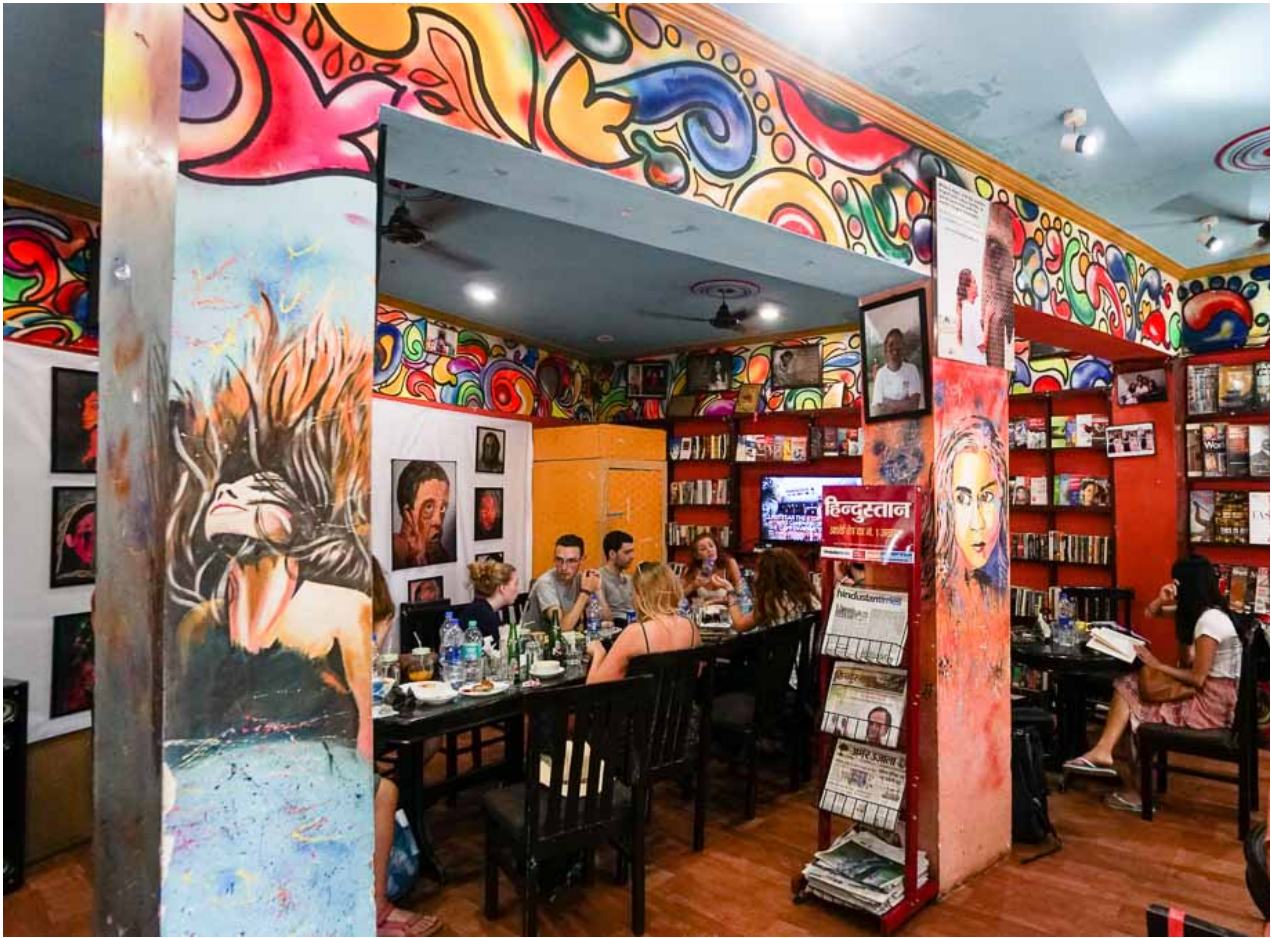
A cafe run by acid attack survivors

Project: Relocation of Sheroes Hangout, Agra